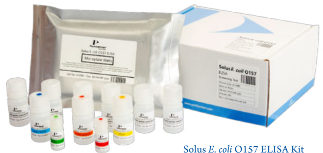
Solus E. coli O157 ELISA Kit

With our Solus E. coli O157 ELISA kit, you have a fast, sensitive immunoassay that delivers results in about 18 hours – with 2 hours to presumptive negative/positive results after selection enrichment. In addition, our Solus solutions can make your lab more efficient and cost effective – and your results more reliable than ever before.