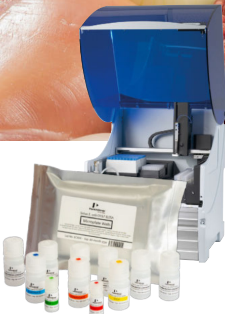
Solus E. coli 0157 ELISA Assay and Automated Workflow Package