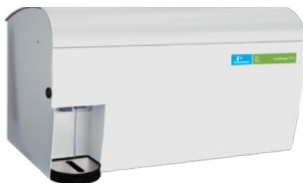
LactoScope™ Milk and Dairy Products Analyzer