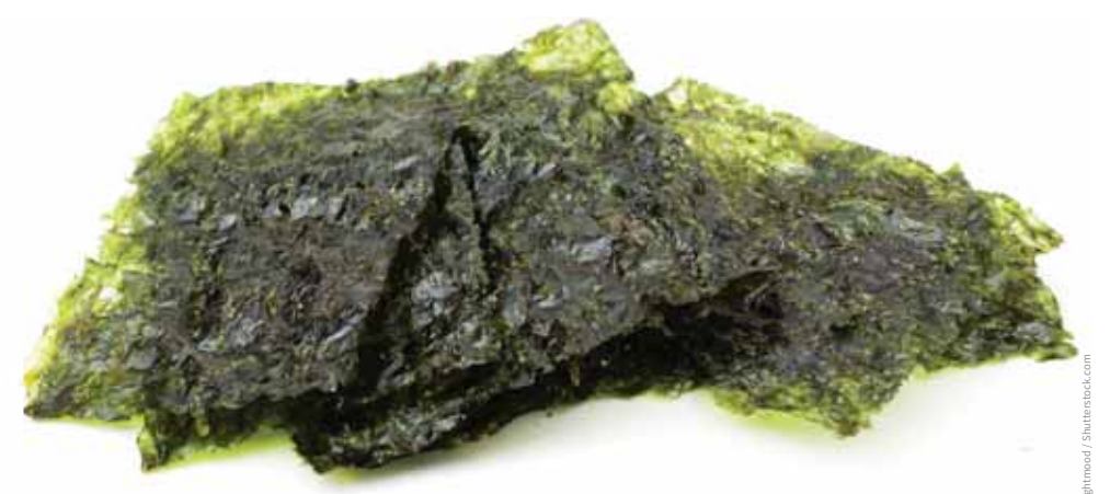
Seaweeds are a substantial source of prebiotic fibres, amongst other proven health benefits

A report published by WHO<sup>III</sup> stated that iodine deficiency was the world's greatest, single cause of preventable mental impairment, and its deficiency negatively impacts the intellectual ability of an individual by between 10 and 15 IQ points. It is widely recognised that seaweeds are a robust source of iodine and they are often referred to in precautionary terms with respect to potential toxicity that could result from excessive consumption of certain species, particularly brown seaweeds. However, iodine concentrations vary considerably among species and Nitschke and Stengel<sup>III</sup> analysed 19 species of seaweeds for iodine content and reported 359-1920µg·g<sup>-1</sup> (fresh weight) in the browns; 9-174µg·g<sup>-1</sup> in the reds; and 3-14µg·g<sup>-1</sup> in the green seaweeds measured. Studies on iodine bioavailability from an edible seaweed administered daily to a group of